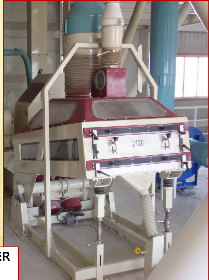
DESTONER PVS 7