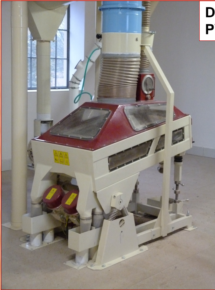
DESTONER PVS 3